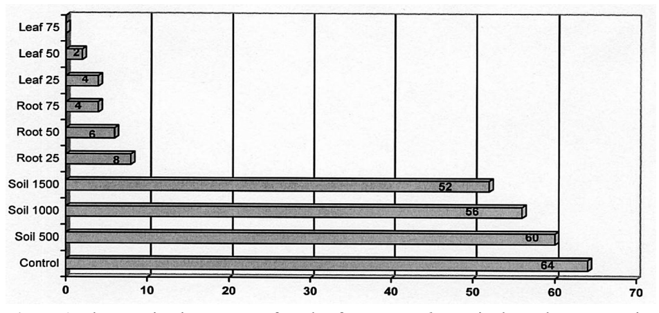
Figure 1. The germination energy of seeds of Festuca rubra L. in dependence on various concentrations of studied extracts

Comment: Means in lines estimated with the same letters do not differ significantly.